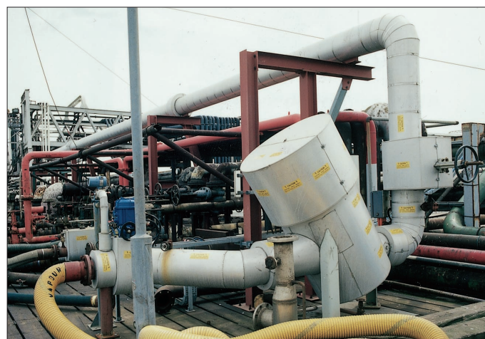
Temperature Maintenance of Process Pipework/Equipment