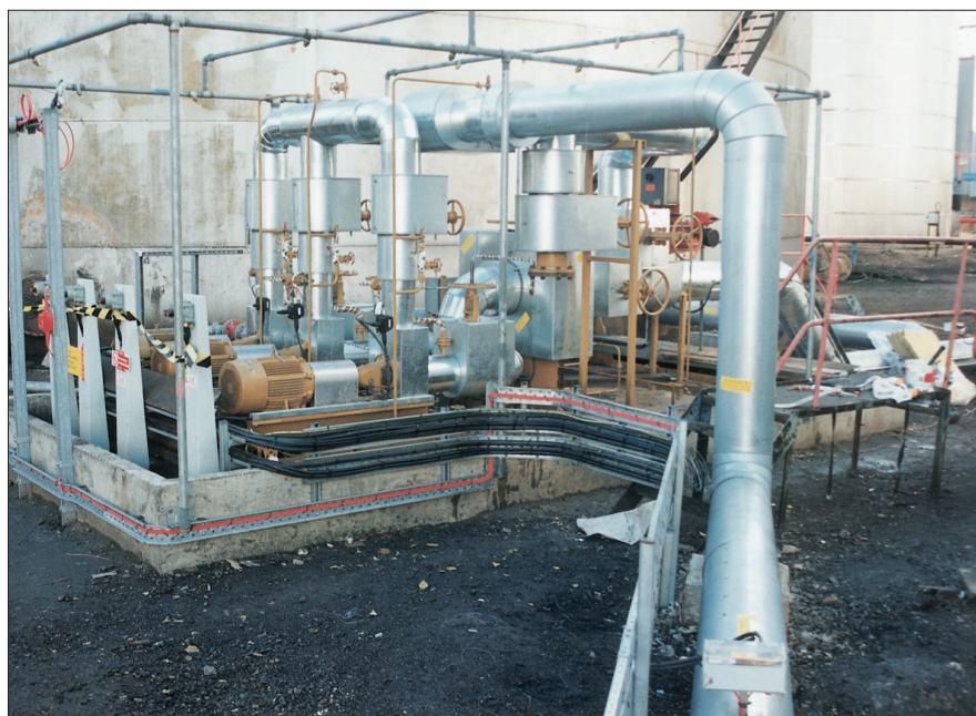
Trace Heating and Insulation of Process Pipework and Pumps

Cross Stainless Steel sheathed single conductor heating cable provides resistance to most corrosive substances. For applications up to 600°C.